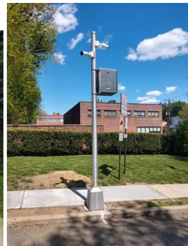
PHASE ONE TYPICAL TRAFFIC LOCATION – MERRIVALE AND NORTHERN BLVD